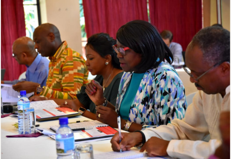
Retreat of the United Nations Country Team in Madagascar, 12 February 2019