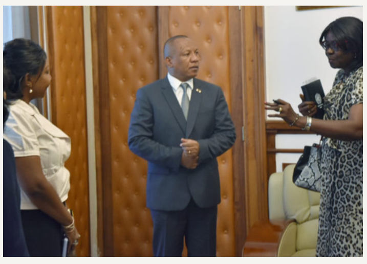
Photo account of the visit of the UNESCO Regional Director, 11 to 13 February 2019