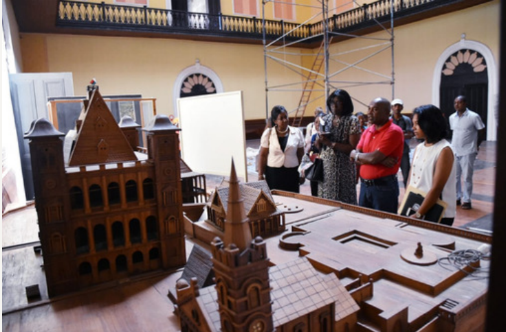
Visit of the Palais d'Andafiavaratra and the Rova de Manjakamiadana to assess UNESCO's cultural support to Madagascar through the rehabilitation phases of the two palaces