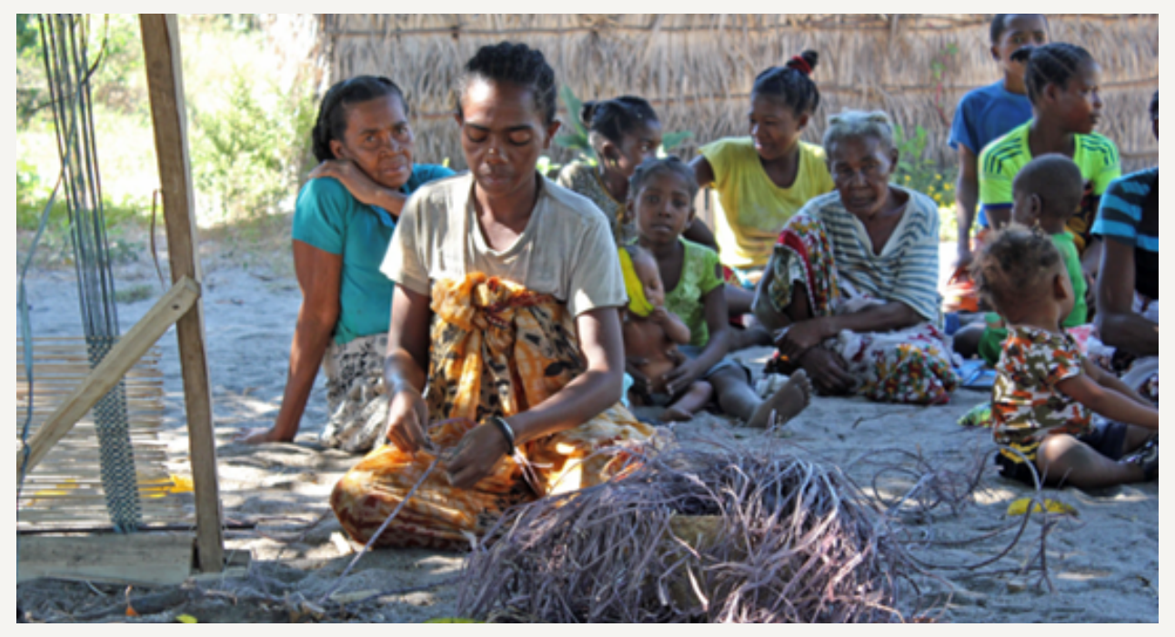
Mahavavy Kinkony women working the raffia