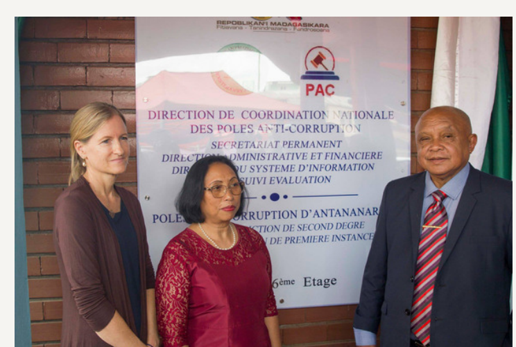
Since 2018, UNDP has supported the establishment of the first Anti-Corruption Pole (PAC) of Madagascar as part of its governance programme. This new jurisdiction will strengthen the repression of corruption and financial offences. Another PAC is planned for the province of Mahajanga, to become the spearhead a nationwide fight against corruption.

In this regard, a key achievement was also support to the development of the Government's Integrated Development Strategy for the South (SIDGS) that seeks to break the vicious cycle of crises and dependence on humanitarian aid that regrettably continues to define this part of the country. Once validated by the new Government, this Strategy will guide the Region's unique development planning framework, and synergistically link all initiatives in this area, with a strong on supporting improvements to infrastructure, access to water and renewable energies.