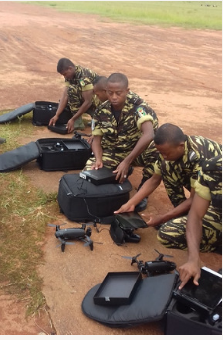
The training of Defense and Security Forces is an integral part of the strengthening of State authority in areas presenting security risks for the populations. In Betroka (Anosy Region), Gendarmerie members received training in piloting and handling drones supplied by UNDP through a funding from the United Nations Peacebuilding Fund.