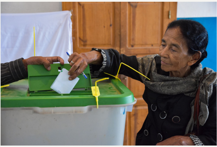
The Electoral Cycle Support Project in Madagascar (SACEM) has prioritized the participation of women and young people in order to establish exhaustive voters' list that are representative of the population. Thanks to the two major nationwide outreach campaigns carried out in 2018, women represented more than 46 percent of the electoral roll for a total of 4,565,539 voters.