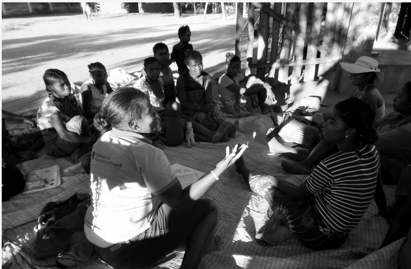
Dialogue and training of women to increase their participation so that they become messengers of peace .

An office will also be opened in Mauritius to improve and capitalise on our collaboration with the Mauritian government. In Madagascar, UNFPA will seek to enlarge its office in Toliara to better serve the particularly vulnerable population of the Great South. It will also continue the implementation of its pole of excellence in the region of Androy, which faces the greatest challenges, with humanitarian indicators in the red, despite an increasing Human Development Index (HDI) in the region.