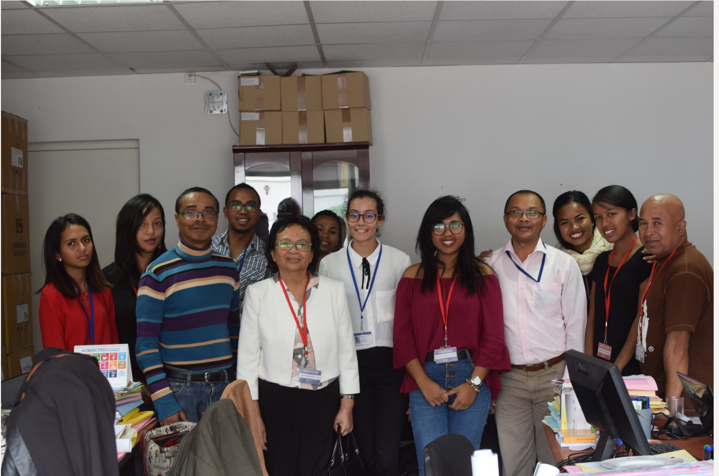
The president of the CNIDH visits the human rights monitoring unit established within OHCHR's offices in Andraharo during the legislative elections.

OHCHR is also pursuing the implementation of its “Human Rights and Elections Strategy” to help the Malagasy government preserve the democrating gain acquired since the 2013 presidential and legislative elections, and consolidated by the 2018 presidential elections. The primary aim of the strategy is to encourage participation of national actors in the prevention of electoral violence and human rights violations. In this respect, OHCHR conducted human rights monitoring during the recent legislative