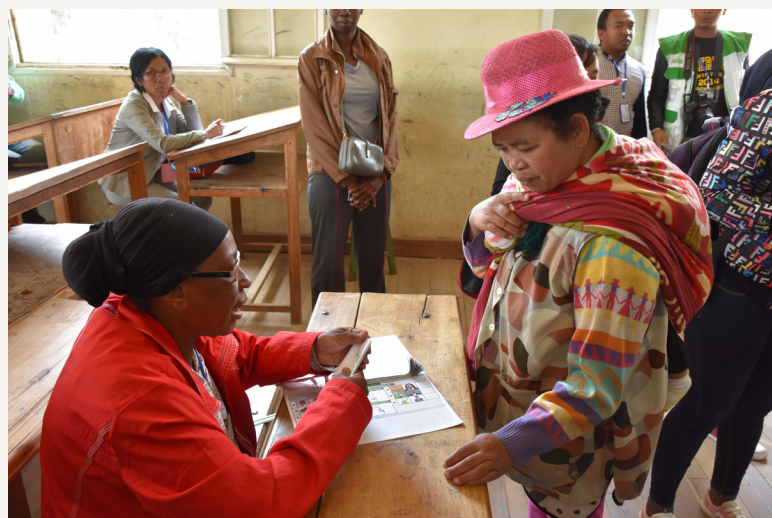
The legislative elections took place peacefully despite a decline in voter turnout

Voters went to the polls for the legislative elections on 27 May 2019, from 6.00 a.m. to 5.00 p.m. The polling was conducted in a generally calm atmosphere despite hints of tension. Only two polling stations did not open, and although a few slight delays happened, they have not affected the voting. Delegates for each candidate were present at polling stations and were able to carry out their tasks. The voter turnout during the 27 May elections was estimated at 40 percent.