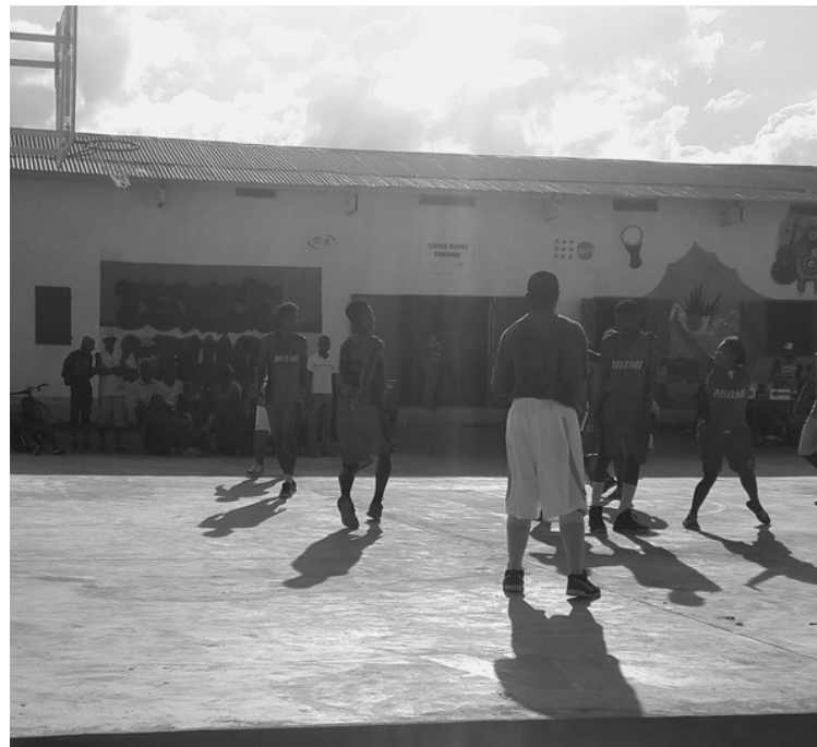
UNFPA supports the Government's commitment to achieve demographic dividend through a series of actions (advocacy, awareness-raising, training, access to health services, youth empowerment, etc.)

Here are some quick facts about year 2018 :