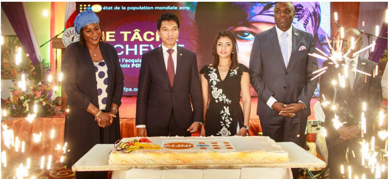
Her Excellency the First Lady of Madagascar, Mrs. Mialy Rajoelina, was appointed UNFPA anti-gender-based violence champion on 12 April 2019