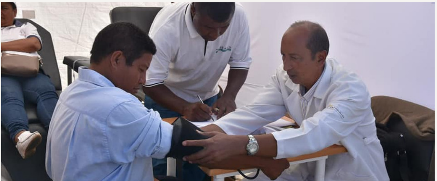
Free diabetes testing during the exposition organized on the World Health Day at the Colyseum of Analamahitsy

The UN SG also outlined that "we must invest in people. We need highly trained and skilled health workers who can educate and advocate for their patients. We need empowered individuals who know how to take care of their health and that of their families. And we need communities to have access to health care when and where they need it". This will enable us to reach our goals and attain universal health coverage.