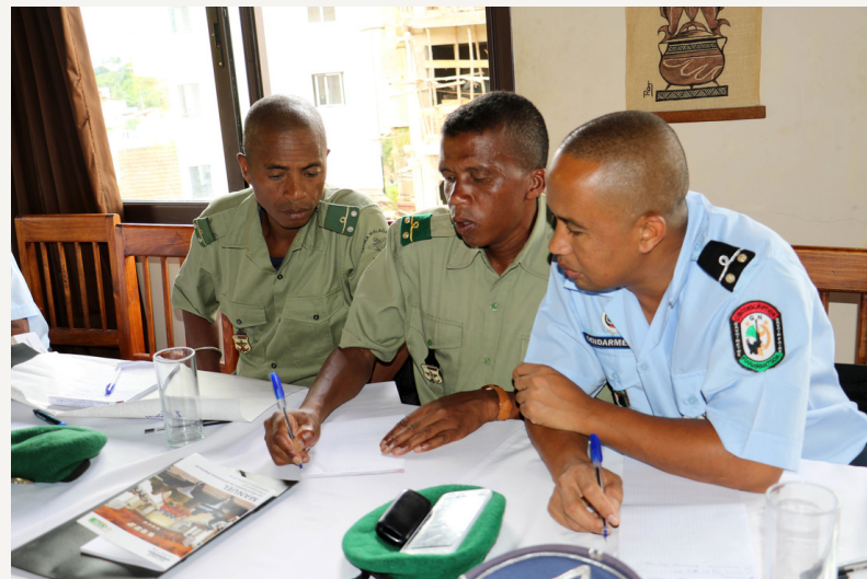
Refresher trainings for Defence and Security Forces (FDS).

With support from SACEM, refresher trainings for Defence and Security Forces (FDS) were also conducted in March 2019 in the districts which face specific risks, to ensure the security of the electoral process before, during and after the 27 May vote.