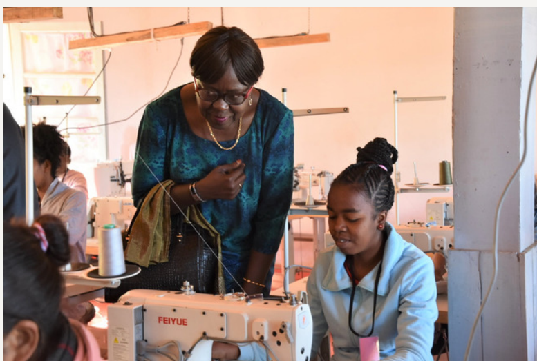
Visit to the Vocational Training Center of Ambohidratrimo

Next, they visited the Mother and Child Hospital and its "Kangaroo Mother Care Unit", which was opened in 2002. The unit provided care for 30 newborns per month in 2018. Thanks to support from the United Nations System, the center was repurposed to be a leader in using the kangaroo care method. The UN system also equipped the surgical bloc, renovated the maternity hall and provided women with delivery kits.