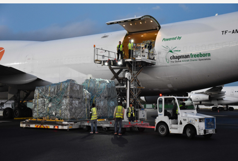
Arrival of electoral printed matter

After the announcement of the provisional results by the CENI, the High Constitutional Court will announce the official results in two weeks.