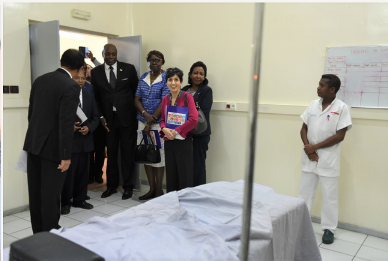
Visit to the University hospital for obstetric-gynecology of Befelatanana