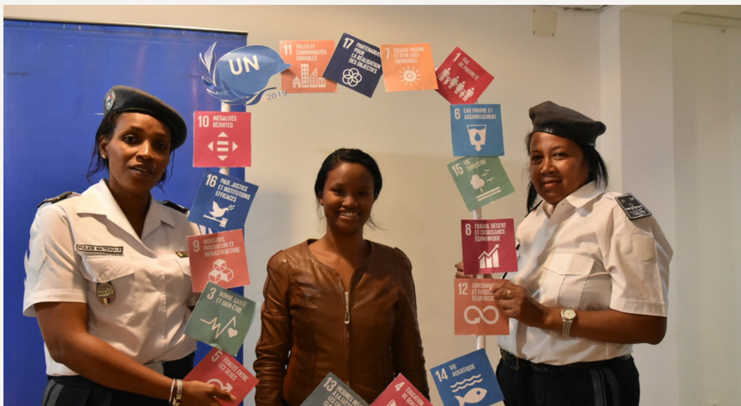
Two former Malagasy UN peacekeepers promoting the culture of peace at the conference on peacekeeping organized during the International Peacekeeping Day, on 29 May 2019, IKM

The members of the United Nations Club spoke of the history of the International Peacekeepers Day, and high school students presented cultural activities to entertain the audience.