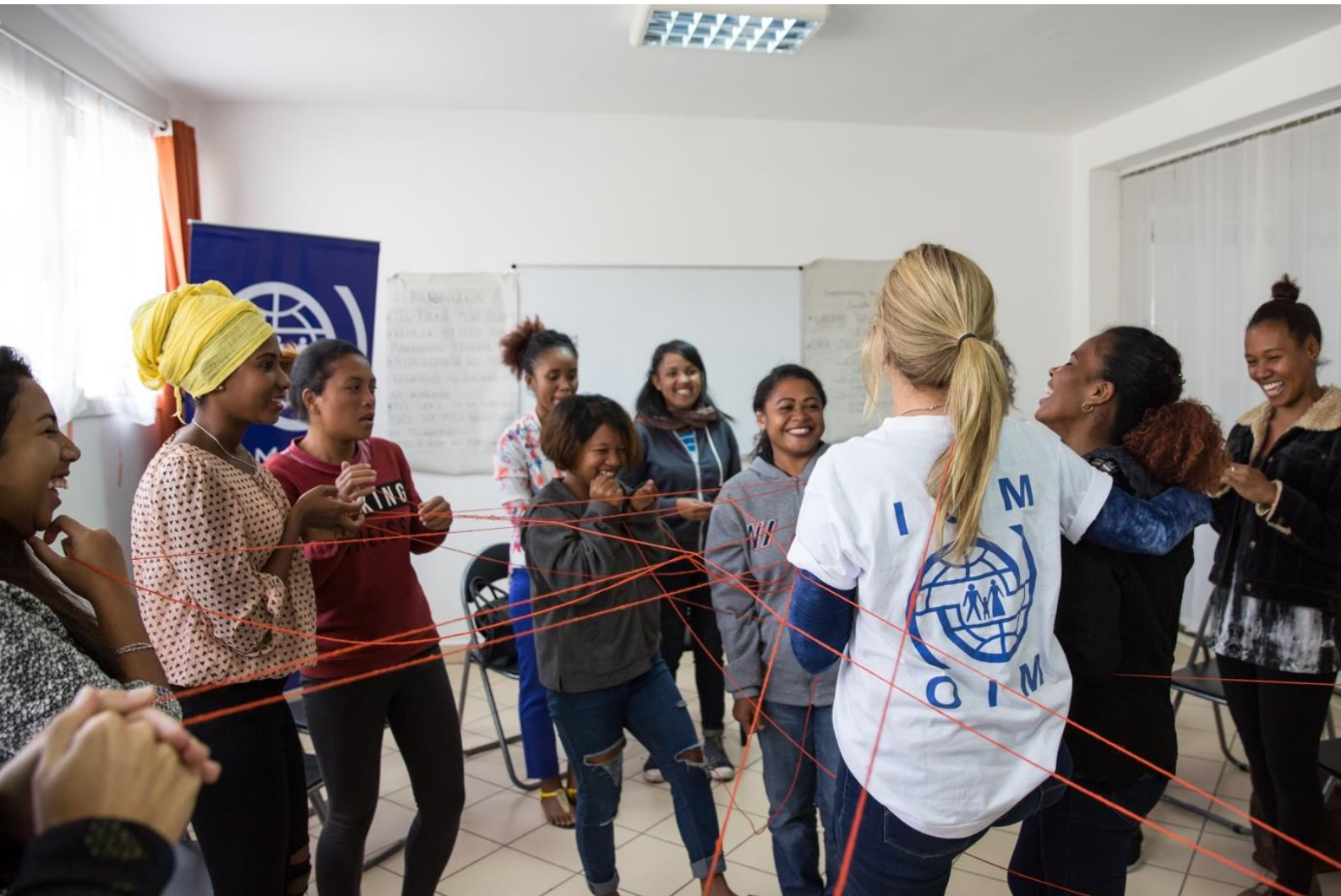
Psycho-social reintegration support and assistance is a crucial part of the work of IOM Madagascar with Victims of Trafficking.

Through 2018, IOM continued to hold periodical bilateral meetings with Ministers and other senior-level officials from the key ministries and public entities with a stake in migration governance, as well as frequent work sessions with mid-level management officials and technicians from the same ministries and public entities. IOM participated in numerous national platforms and coordination groups, led by the GoM, UN agencies, or the diplomatic community, where it provided expertise on issues pertaining to international migration law and to upholding migrants' rights.