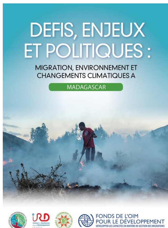
Cover of the Country Assessment "Défis, enjeux et politiques: Migration, environnement et changement climatique à Madagascar"

In January, May, and September 2018 respectively, IOM together with the National Disaster Risk Management Authority (“Bureau National de Gestion des