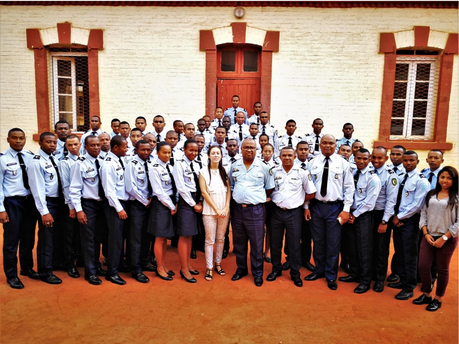
Sensitization and capacity building session on Trafficking in Persons with students from the Gendarmerie School in Moramanga

50 students of the ENMG in December 2018. A first round of trainings for the Police School (“Ecole Nationale des Inspecteurs et Agents de Police d’Antsirabe” – ENIAP) and the Gendarmerie School (“Ecole de Gendarmerie de Moramanga”) benefit one hundred and thirty-six student police officers and gendarmes.