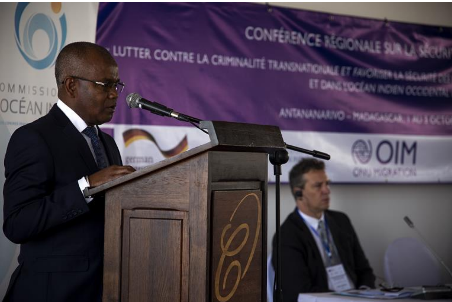
The Minister of Defense giving the keynote address during the opening of the first edition of the Regional Maritime Security Conference in Antananarivo